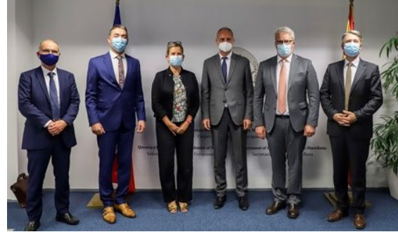
The delegation with Mr Nikola Dimitrov, North Macedonia's Deputy Prime Minister for European Affairs

● North Macedonia was granted candidate country status back in 2005. The signing of the Prespa agreement in June 2018 settled the dispute with Greece over the country's name. However, the actual start of accession negotiations has been vetoed by Bulgaria , due to a bilateral dispute over language, the country's name and relations with the Macedonian minority in Bulgaria. Although the context of the forthcoming presidential and parliamentary elections in Bulgaria does not seem very favourable, the delegation hopes that a satisfactory compromise can be found quickly with Bulgaria to enable the start of accession negotiations for North Macedonia, which has been knocking on the European Union's door for 16 years.