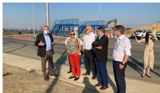
The delegation visited the Suez waste treatment plant in Vinca near Belgrade

In Serbia, as in North Macedonia and Montenegro, it would be advisable to reinforce the French economic presence, particularly at the SME level. An economic symposium on the Balkans should soon be organised by the Friendship Group in the Senate in order to encourage French companies to take greater interest in this region.