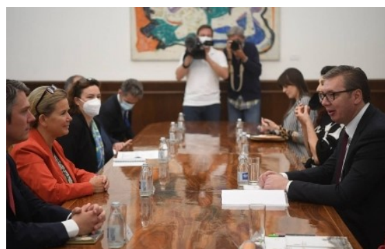
The delegation with the President of the Republic of Serbia, Mr Aleksandar Vucic