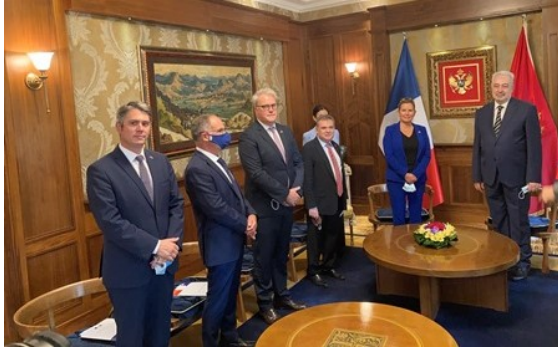
The delegation with the Prime Minister of Montenegro, Mr Zdravko Krivokapic

After remaining relatively unscathed at the start of the COVID-19 pandemic, these countries have since been hit hard by the health crisis . Confronted by a shortage of vaccines, some of them, such as Serbia, have turned to Russian and Chinese vaccines.