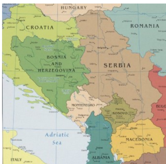
Map of the Balkans

The aim of this mission was to take stock of the internal situation in these countries, the process of rapprochement with the European Union, and their relations with France.