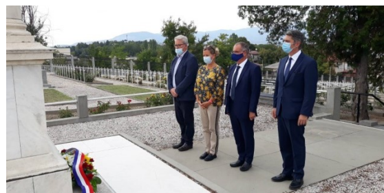
The delegation laid a wreath in tribute to French soldiers at the military cemetery in Skopje

Yet France is exceptionally well regarded , based on the past comradeship in arms and its political and military involvement in resolving the conflicts in the former Yugoslavia.