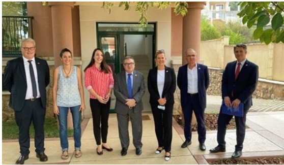
The delegation visited the new French school in Podgorica

As far as cultural and linguistic cooperation are concerned, and despite the presence of French cultural centres and schools, the French language is losing ground , lagging far behind English, as well as German and Italian. Very few scholarships are granted to students from these countries. Our country should do more to encourage the speaking of French , in particular by training administrative staff in French, granting more scholarships to students, and promoting the creation of bilingual or international classes in education.