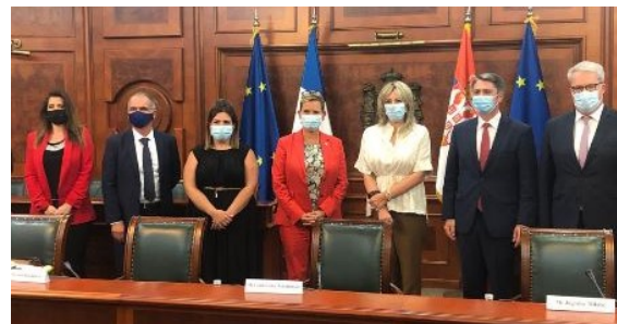
The delegation with the Serbian Minister for European Integration, Ms Jadranka Joksimitovic

● Serbia , which has opened 18 out of 36 chapters of the accession negotiations, hopes to open more chapters under the Slovenian or French Presidencies of the European Union. However, the European Commission believes that considerable progress still needs to be made in terms of democratic pluralism, the rule of law, judicial reform and press freedom. Regional reconciliation also remains a challenge, including dialogue with Kosovo.